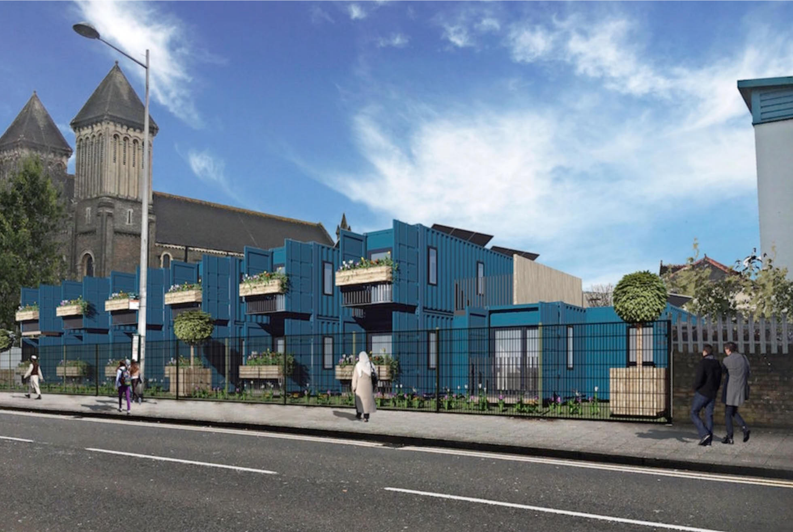
Blue Containers Bute St CGI